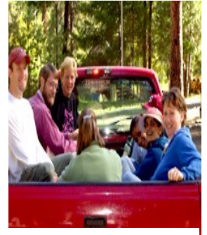
Residents and faculty enjoying a community service project in the nearby Cascade Mountains